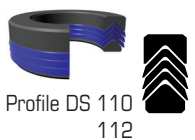
Profile DS 110 112