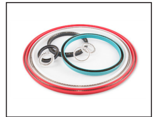
Spring Energized Polymer Seals