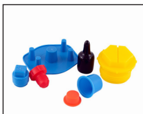
Cap and Plugs