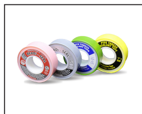
PTFE Sealing Tape