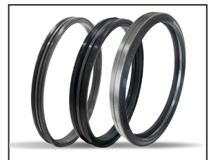
Mechanical Face Seals