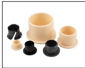
Engineered Polymer Bushings