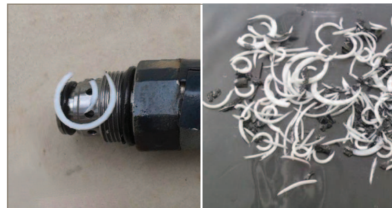
PTFE back-ups are pinched and broken during installation; leading to seal failure.